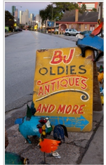
BJ Oldies and Antiques